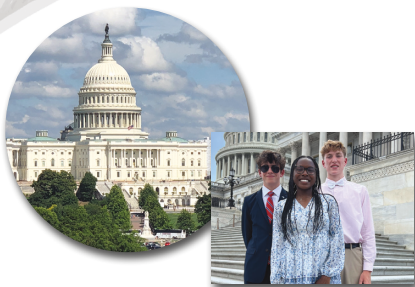
Washington Youth Tour: June 15-20, 2025

We've made it easy to apply for either FREE trip. Apply today!