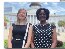
Cooperative Youth Summit: July 14-17, 2025