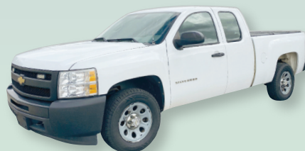
Grand Prize 2013 Chevrolet Silverado

Each member who registers and votes will receive a LED Lantern/Flashlight.