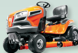
Second Prize Husqvarna 42-inch Riding Lawn Mower